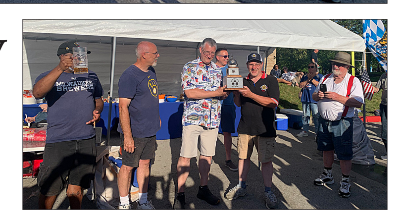
GAPA 4740 N. Western Ave Chicago, IL 60625

Kameradschaft, Freundschaft und Gemuetlichkeit!